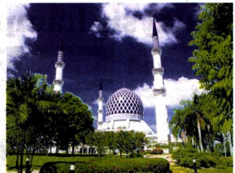
SEBANYAK 375 masjid di seluruh Selangor yang berdaftar dengan JAIS terlibat dalam pengurangan elaun bermula Mei lalu. - GAMBAR HIASAN

Bagaimanapun, jumlah RM1,430 itu kini terpaksa dikurangkan kepada RM800 bagi memberi keutamaan kepada keperluan golongan fakir miskin yang memerlukan.