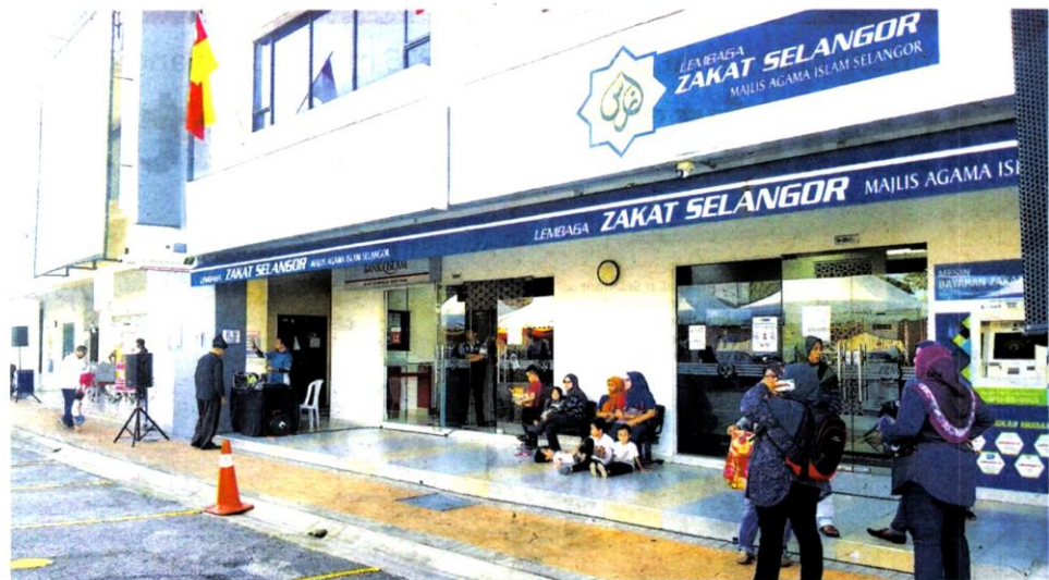
LZS dijangka menstrukturkan semula pengagihan zakat tahun ini bagi memenuhi keperluan lebih 60,000 keluarga asnaf. – GAMBAR HIASAN

mula meningkat pada Mei lalu dengan mencatatkan RM135.9 juta termasuk zakat fitrah berbanding tahun sebelumnya sebanyak RM113.5 juta selepas Perintah Kawalan Pergerakan Bersyarat (PKPB) dilaksanakan kerajaan," tambahnya.