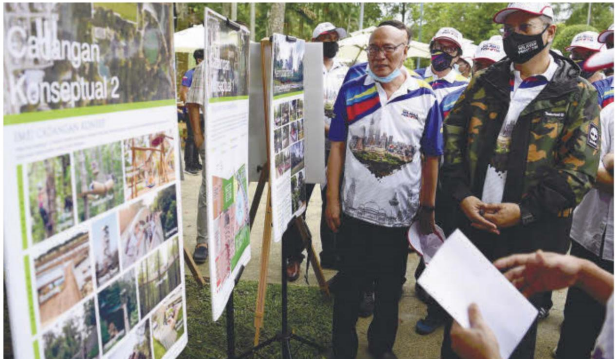
Annuar and Nor Hisham (left) at a briefing on the Bukit Kiara Public Park Beautification project.