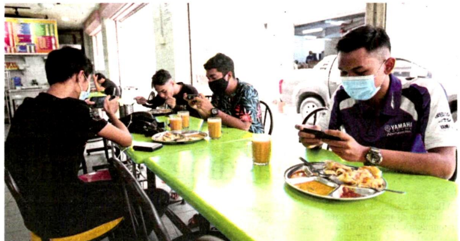
Kebanyakan peniaga restoran terjejas ketika PKP dan peluang melanjutkan operasi premis hingga jam 2 pagi memberi peluang menambahkan pendapatan. (Foto hiasan)

Keputusan itu menyusul sehari selepas DBKL memaklumkan semua operasi premis perniagaan di Kuala Lumpur masih dikekalkan sehingga jam 12 tengah