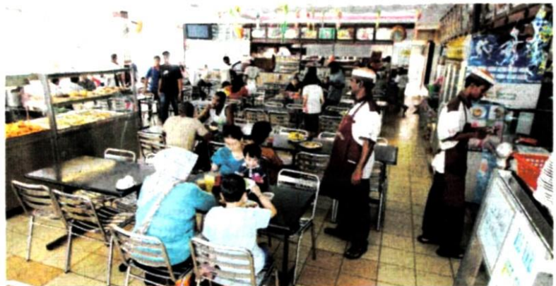
RESTORAN di Selangor boleh beroperasi sehingga pukul 2 pagi.