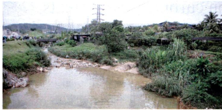
The MACC reportedly has begun investigations into the issue of pollution of Sungai Gong

"Open investigation papers against the directors, who are behind the water pollution and collecting the profit. The directors should take responsibility," he told The Malaysian Reserve (TMR) .