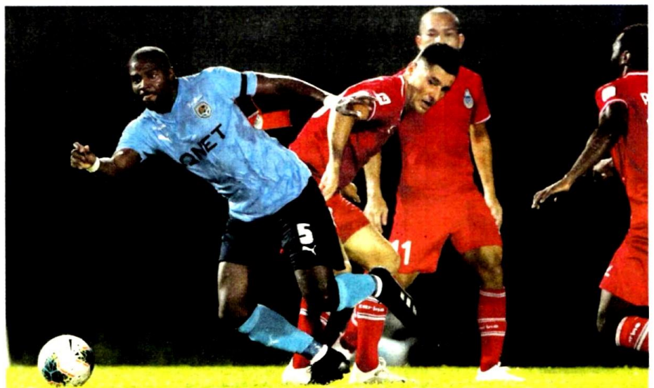
PJ City gagal meraih tiga mata selepas terikat seri 1-1 dengan Sabah dalam saingan Liga Super di Stadium Majlis Bandaraya Petaling Jaya, kelmarin.

Dalam pada itu, Pengerusi Jawatankuasa Pengadil Persatuan Bolasepak Malaysia (FAM),