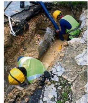
COMPASSION FOR EARTH Petaling Jaya

They finally left at 9pm, the job done. Hopefully it was their last call.